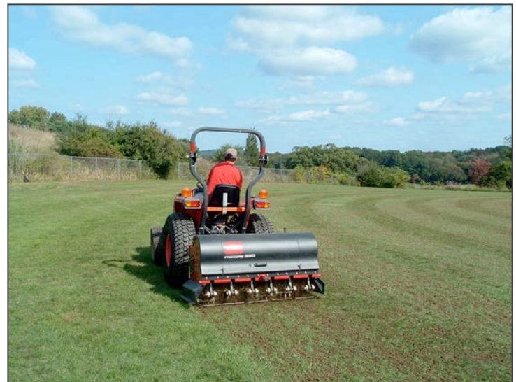
Figure 3. Use only Power Take-Off (PTO) driven, vertically-operating, core cultivation units. These units can provide consistent penetration depth to 3-4". Avoid drum-type core cultivators whenever possible due to their shallow, inconsistent penetration depth.

STC is preferred at this time of year due to less surface disruption than HTC with anticipated heavy fall field usage. STC creates some voids at the surface for gas exchange and water movement, and will also provide some mechanical control for white grubs (McGraw and Holdrege, 2012). Generally in the fall, white grubs are actively feeding (located in the 3-4" soil depth range) from August 1 through November (Figure 5). Therefore, the opportunity to inflict damage to the grubs also spans this range. Further delaying cultivation extends the active feeding period and negatively impacts turfgrass recovery as growth slows with reduced temperatures.