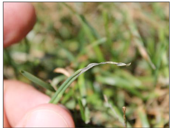
Figure 6. Gray leaf spot can be a devastating disease for perennial ryegrass. Selecting disease resistant cultivars is critical.