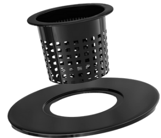
5 gallon bucket