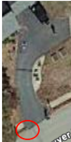
Google Maps satellite image 3 with sampling area circled